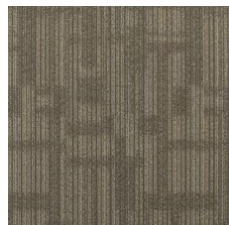
Pottery 62755 LRV 8.2